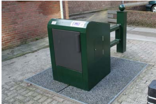
(a) Underground shared container

The first category is the shared underground waste container. Upon identification with an ID card people can dispose of their waste at any time in a nearby container. This system can also record how much waste each household has disposed of. It is usually found in more densely populated urban areas, where space restrictions may not allow for personal containers, or where it is desirable that people can dispose of their waste 24 hours a day. All shared container systems we encountered use a contactless ID card with radiofrequency identification (RFID) chip.