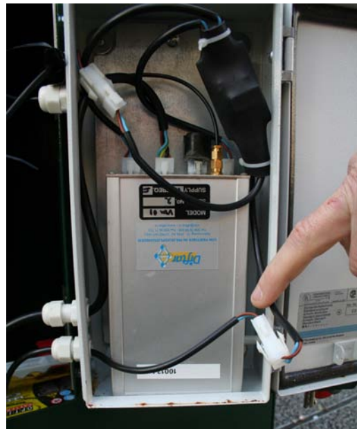
(d) Battery equipped GSM unit

Data is collected locally on a small computer and transmitted to a data processing centre or DPC. This can be done using several transmission techniques including GSM, GPRS, SMS, Mobitex and POTS. The container units can be powered by batteries, or they can be hooked up to the public electricity network.