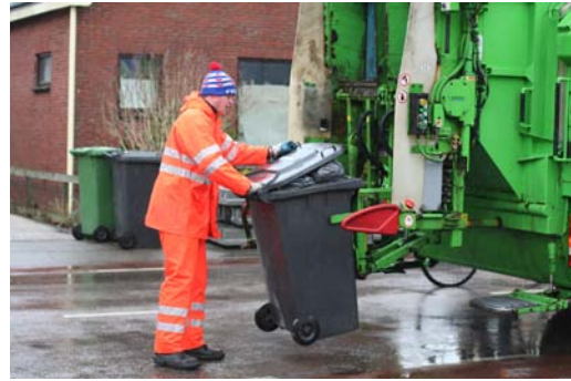
(f) Attaching and determining gross weight