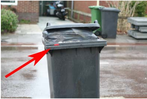
(e) Personal container with identification tag

The second category involves marking the domestic container of a household with an RFID-chip. The collection vehicle records this ID during emptying. The household might pay for each time the container is emptied; another scenario is to weigh the container and charge per weight unit. In the rest of this report we will use the term personal container to refer to this type of waste registration, although it is usually not bound to a discrete person but to a household. In general this strategy is employed in suburban and countryside areas, where people have room to store such containers.