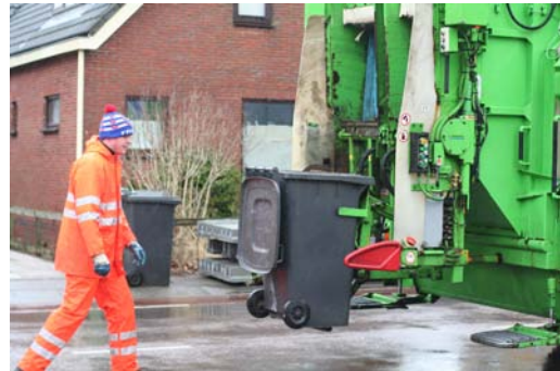
(h) Determining tare weight

Data is accumulated on a small onboard computer and transmitted via the same wireless transmission techniques as the shared containers. Data can also be transferred manually using memory cards.