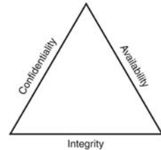
Figure 3: CIA triad

The so-called CIA triad is generally accepted as the base of information security [9, 10, 11]. This triad defines three key concepts that provide the principles of a secure system — confidentiality, integrity and availability. It is often depicted as a triangle (see figure 3) to indicate that all three concepts are needed for complete security.