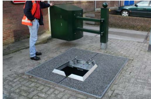
(b) Container arm swung aside, ready for emptying