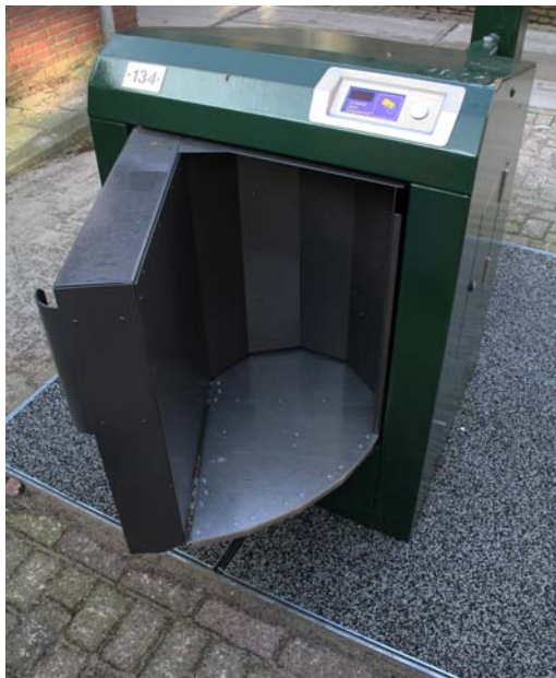
(c) Valid ID card opens door